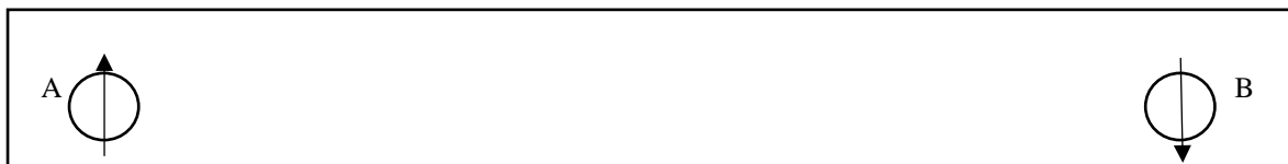
Figure 3. Entangled photons separated at long distances

Entanglement or quantum correlation is the immediate relationship between two or more particles without considering the distance between them [27]. Since the 1990s, a lot of researches have been ongoing since the current computer does not have this feature, including qubit and superposition [21]. Entanglement makes the quantum computer more powerful because the transmission of information can be done simultaneously. Measuring the condition of one of the qubits of an entangled pair of qubit will immediately determine the condition of the other qubits. For example, Figure 3 shows a pair of entangled photons separated at a long distances. Photon A represents the upper spin, while photon B is entangled with photon A, representing the lower spin automatically [30].